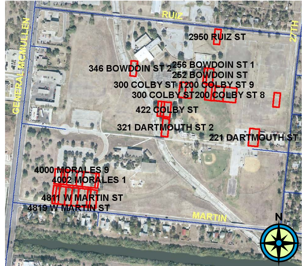
Colby, Ruiz, Bowdoin, Morales, & Dartmouth Properties