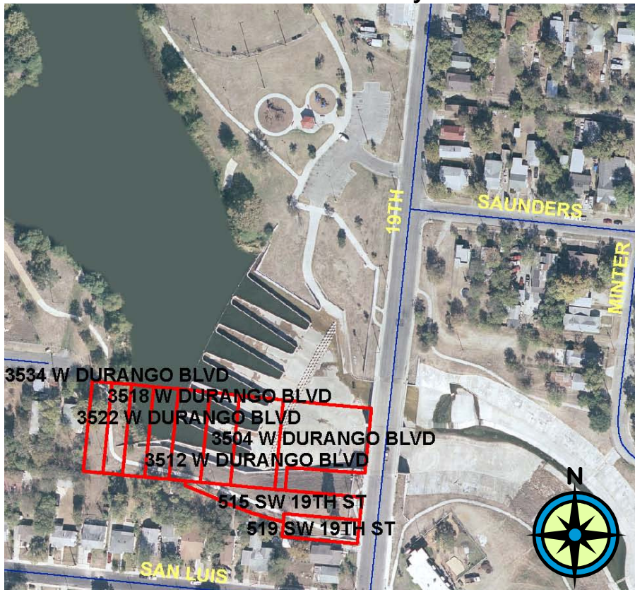
3500-3534 Durango & 515 & 519 SW 19 th Street

Publicly used, un-developable properties Action: Clear with the City of San Antonio