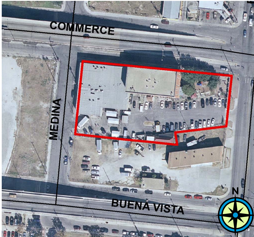
928 W Commerce