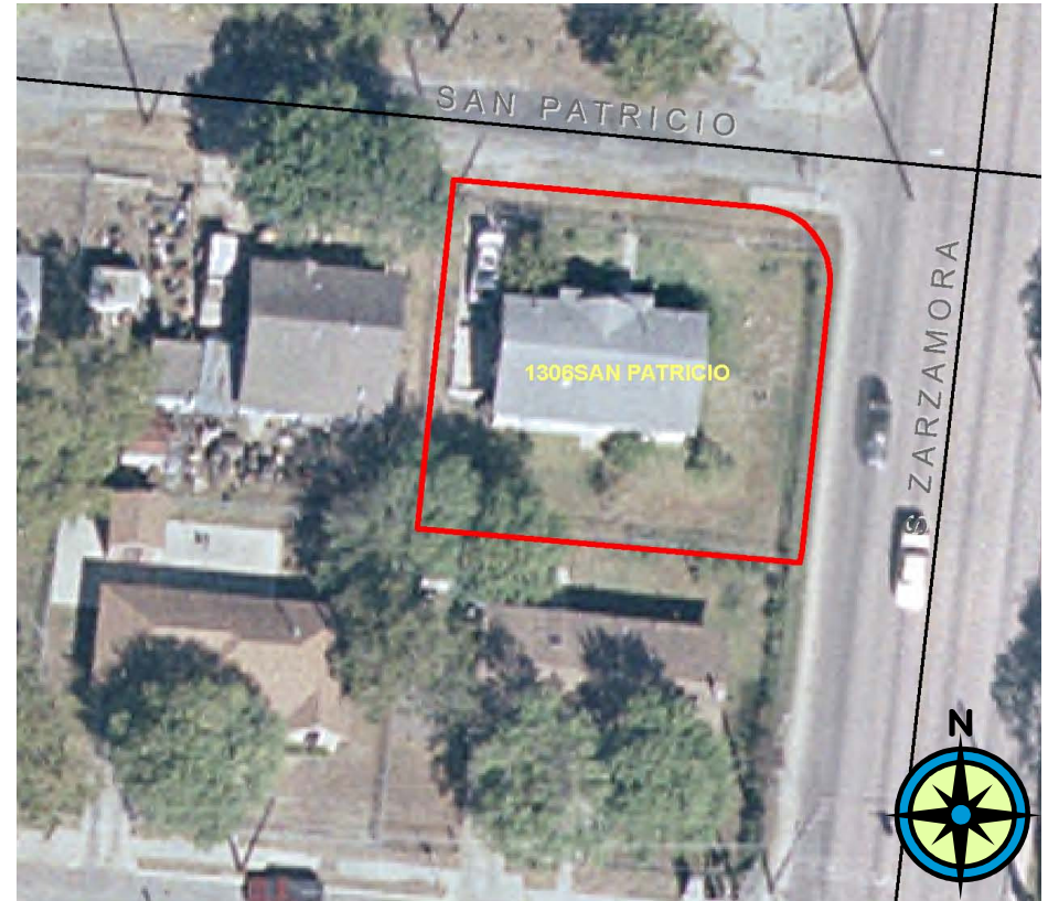
1306 San Patricio