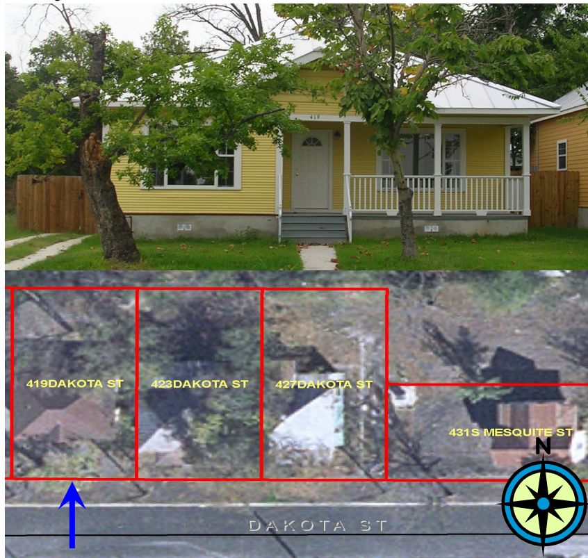
419 Dakota, Historic Gardens Subdivision