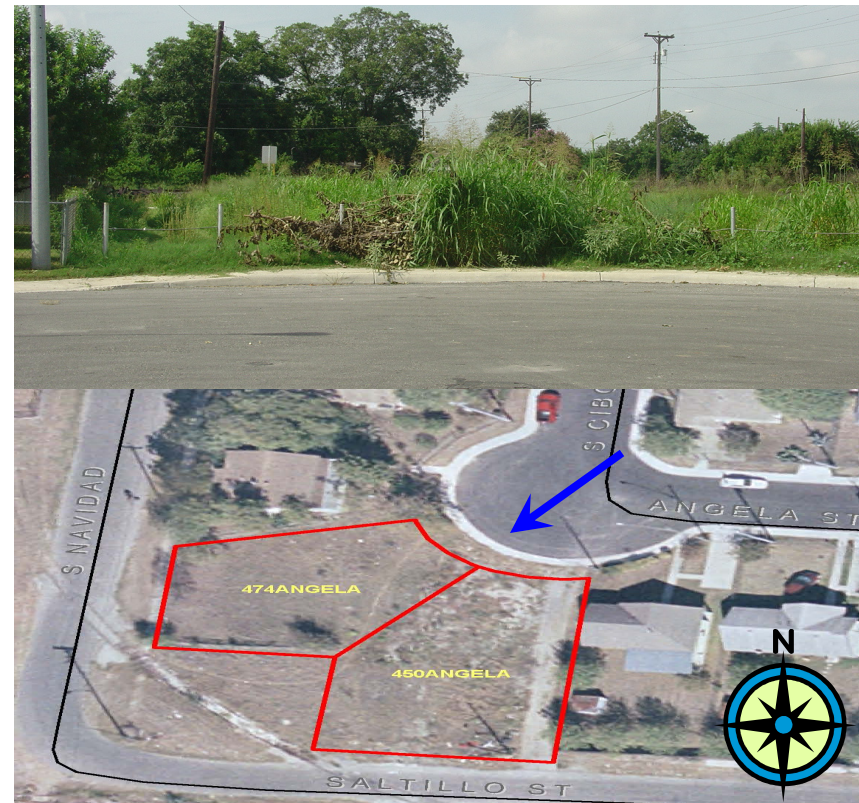
450 & 474 Angela Street, Colonia Amistad Subdivision