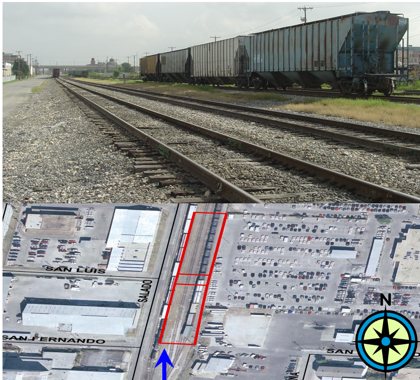
700 W Durango Blvd.

Action: Sell Surplus properties; Sell to current users of properties; Obtain deed records and clear with BCAD